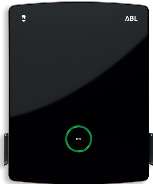
Product number 100000326

The robust design and high-quality workmanship of the Wallbox eM4 Twin protect it from external influences. The wallbox comes pre-installed and ready for connection thanks to the integrated Type A RCCB and DC residual current detection. All ABL wallboxes are made in Germany and comply with the highest safety standards.