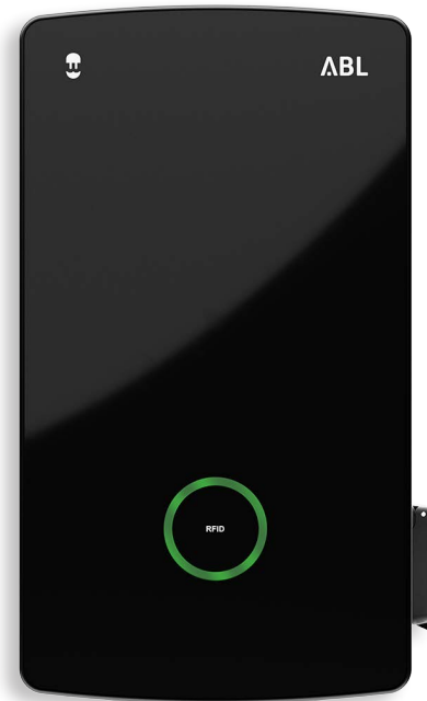
Product number 100000451

The robust design and high-quality workmanship of the Wallbox eM4 Single protect it from external influences. The wallbox comes pre-installed and ready for connection thanks to an integrated Type A RCCB and DC residual current detection. All ABL wallboxes are made in Germany and comply with the highest safety standards.