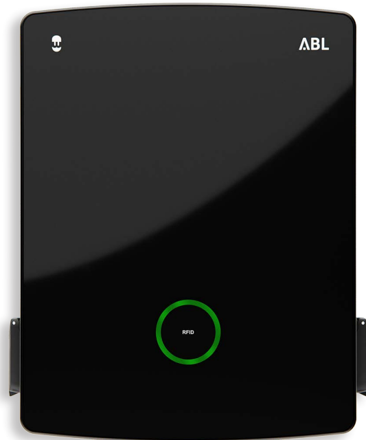
Product number 100000318

The robust design and high-quality workmanship of the Wallbox eM4 Twin protect it from external influences. The wallbox comes pre-installed and ready for connection thanks to the integrated Type A RCCB and DC residual current detection. All ABL wallboxes are made in Germany and comply with the highest safety standards.